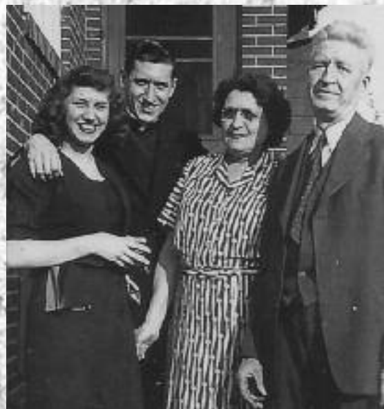
● Above: Cardinal O'Connor at the wailing wall in Jerusalem Above right: "Father John" with family on the day of his Ordination to the priesthood